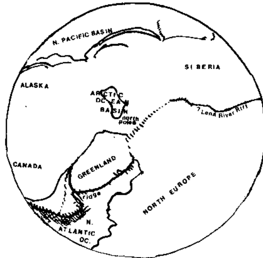
FIGURE B- The Arctic Hemisphere, indicating the largely continental (rather than basaltic ocean-type) bottom; and the North Atlantic Ridge passing by the North Pole and proceeding towards Siberia, where possibly it becomes a land rift proceeding to the Indian Ocean via Lake Baikal. (Pages B to F are author's sketches. In all of them, the outlines of the full continents, including shallow shelves, are drawn.)